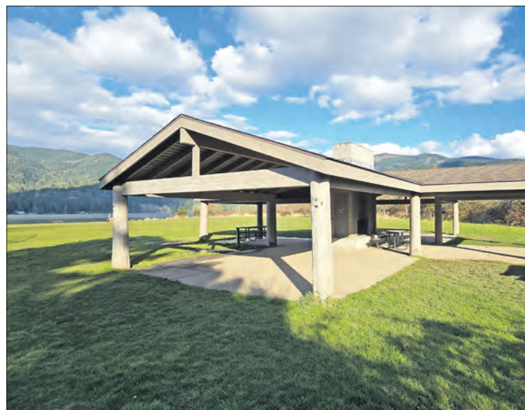
Among Sudden Valley's amenities are two picnic shelters at the edge of Lake Whatcom: one at PM beach, pictured in the top photo, and one at the Marina, pictured above. The Sudden Valley picnic shelters can be rented at a rate of $20 per hour, or $200 for a full day for residents, with a refundable damage and cleaning deposit.