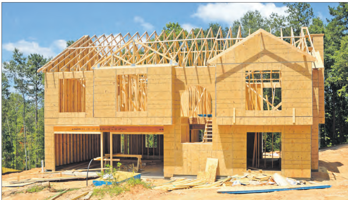
The March 24 Builders' Meeting outlined a number of construction rules and guidelines, such as construction hours, erosion control, and building timelines.

These covenants empower the Architecture Control Committee to protect property values from indiscriminate construction that could adversely affect the general quality of the neighborhood.