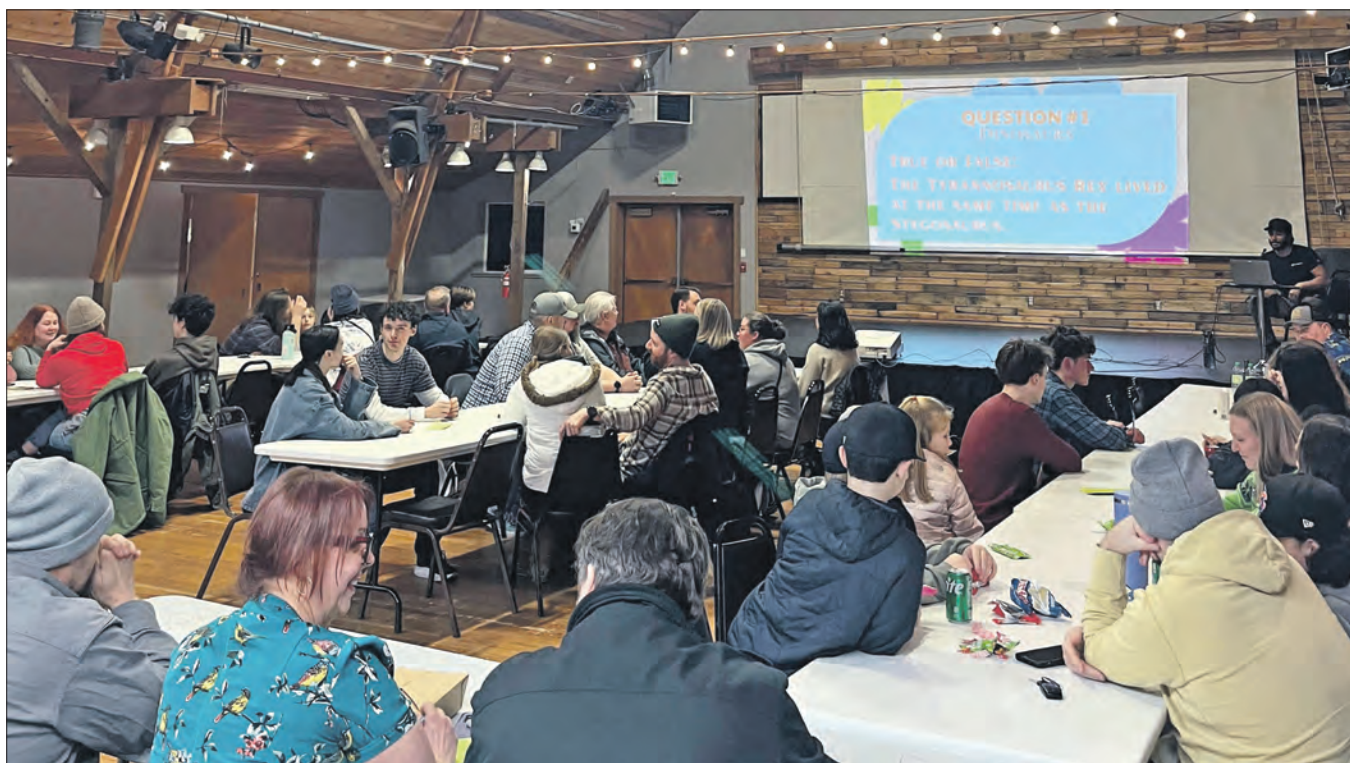
Teams confer as they work through the trivia question, debating the best answer.