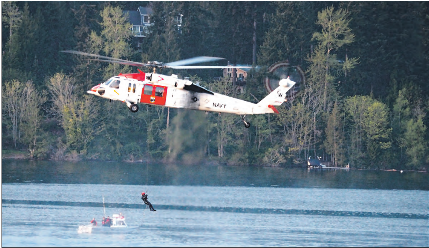
The U.S. Navy put on quite the show on April 24 on Lake Whatcom when it conducted several training drills. They not only practiced flying low, but also dropped two divers into the water and practiced water rescues for more than an hour.