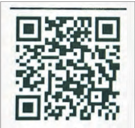
Whatcom Conservation District