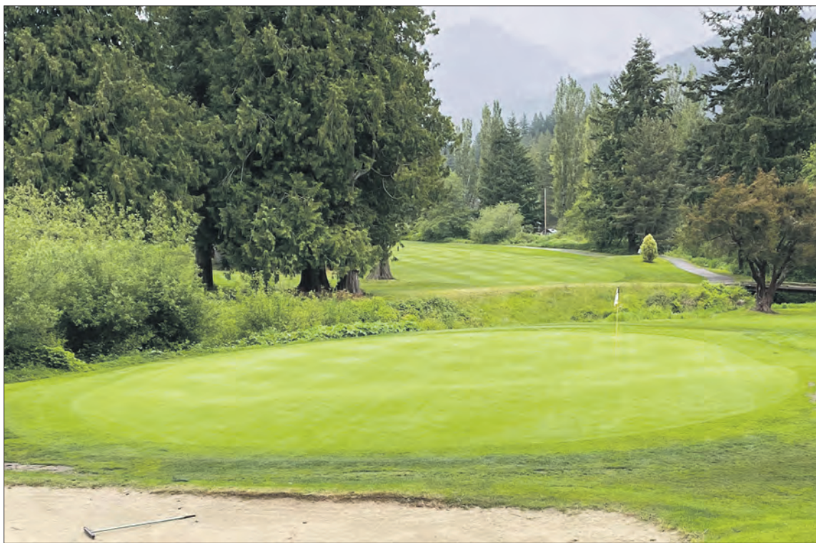
Golf and Turfcare teams have taken advantage of ideal weather conditions to begin summer-level operations, supporting a strong start to the golf season. Pictured, Sudden Valley's recently sodded ninth green that recently reopened.