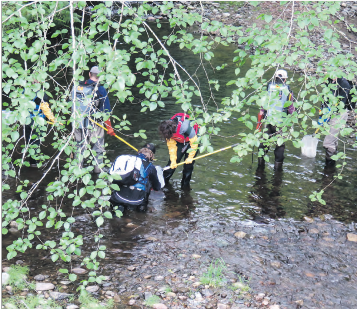
On May 23, Fisheries and Aquaculture Sciences students from Bellingham Technical College surveyed Austin Creek -- and they found fish. Students sampled Austin Creek for what kind of fish, how many fish and the size of the fish. Stay tuned to the July Views issue for their survey results and pictures.