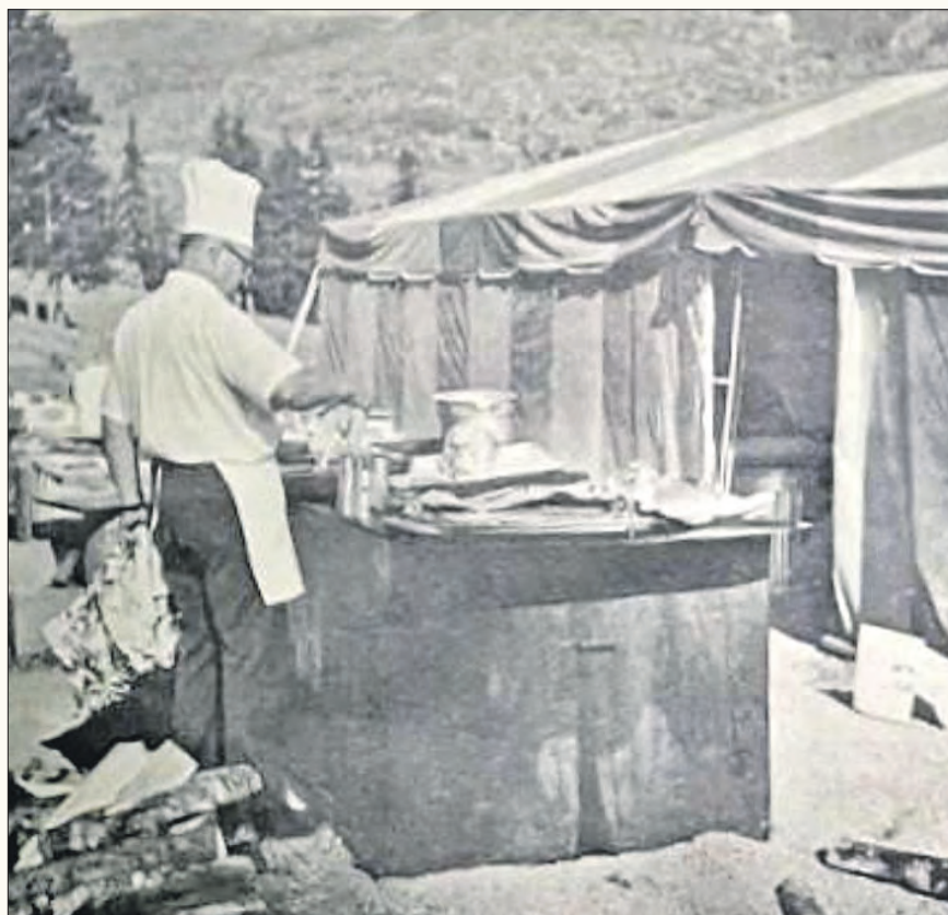
Aromatic barbecued salmon, buttered and hot from the coals, is checked by a leading Seattle chef as he caters to prospective Sudden Valley property owners. A huge, gaily decorated dining tent provides seating for a chuckwagon-style meal, including baked beans, hot dogs, cole slaw, French rolls, coffee and soft drinks.