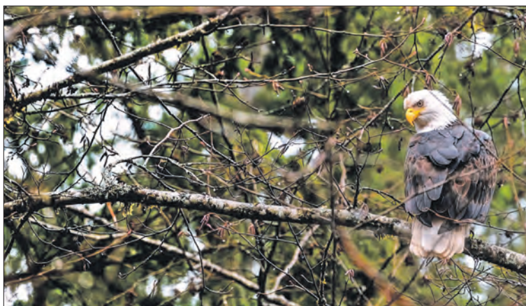
'Owl,' by Aaron Craven, above, and 'Curious Deer at Play' by Virginia Heaven, below, will be on display July 15 through October.

Craven's love of the arts began early through experimentation, sculpture, watercolor, oil,